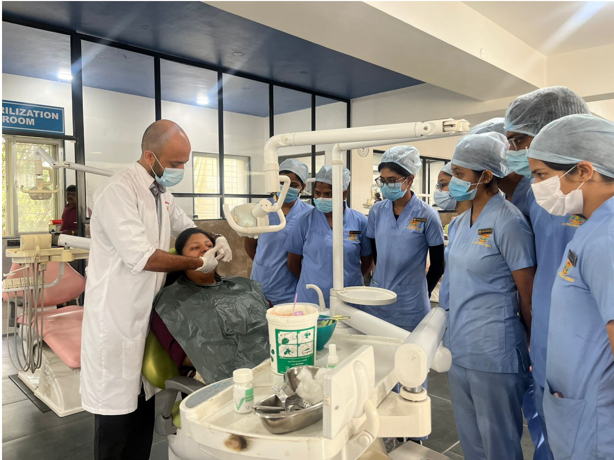
Demonstration by faculty on removable partial denture in department of Prosthodontics