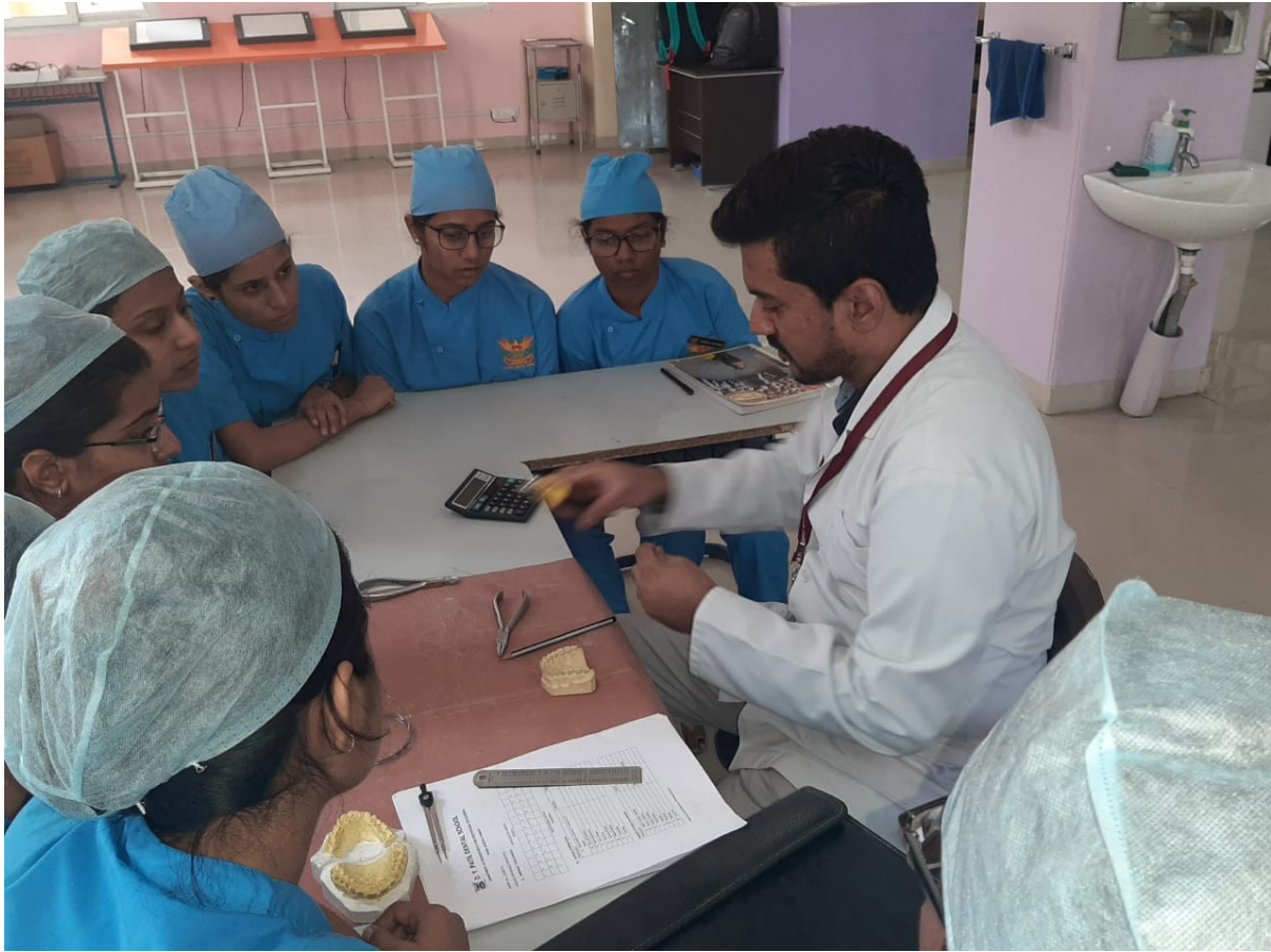
Demonstration by faculty at department of Orthodontics