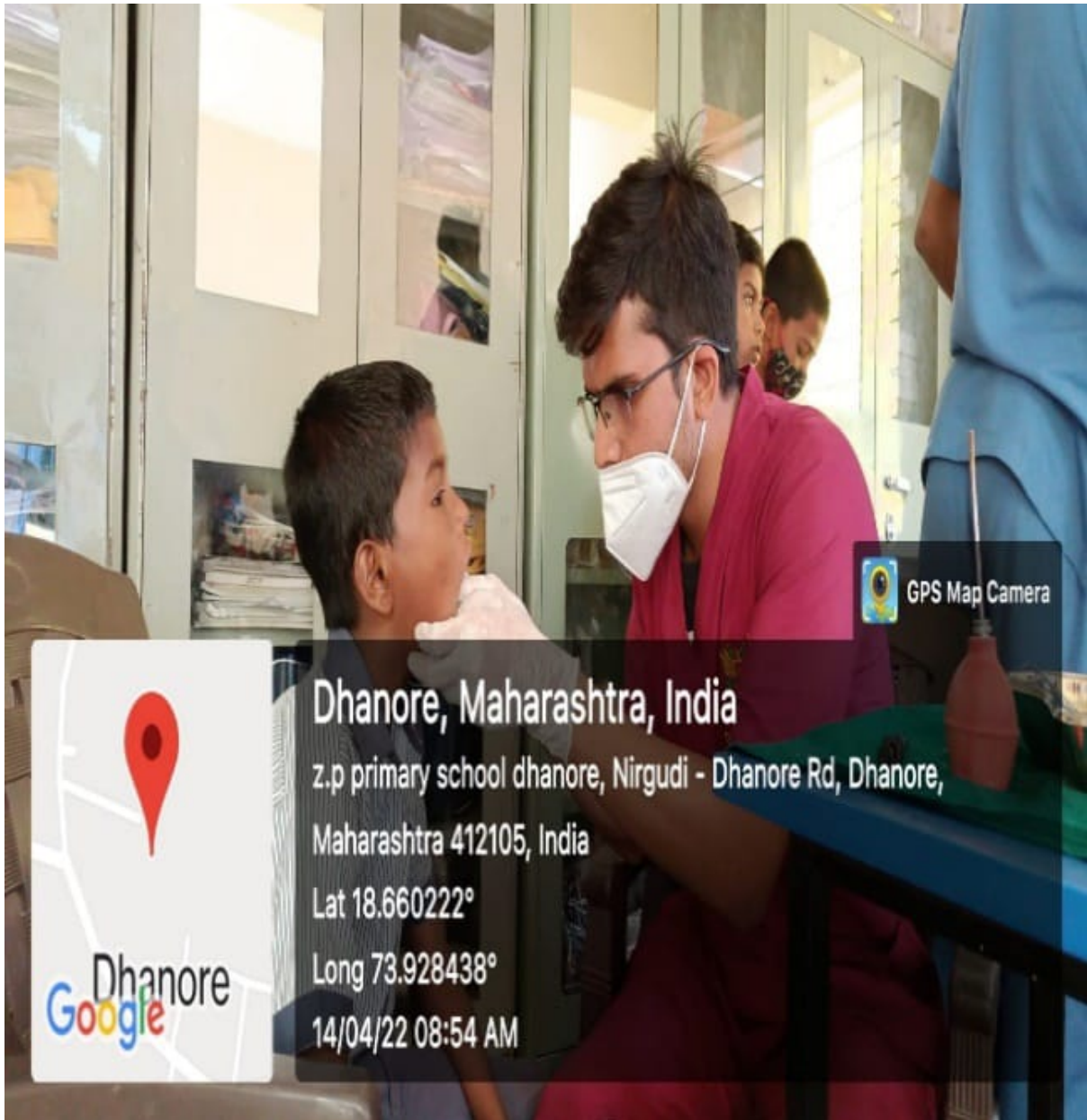
Intra-oral examination by student