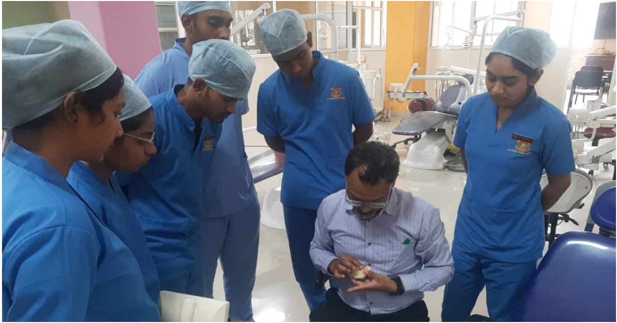
Demonstration by faculty at department of Orthodontics