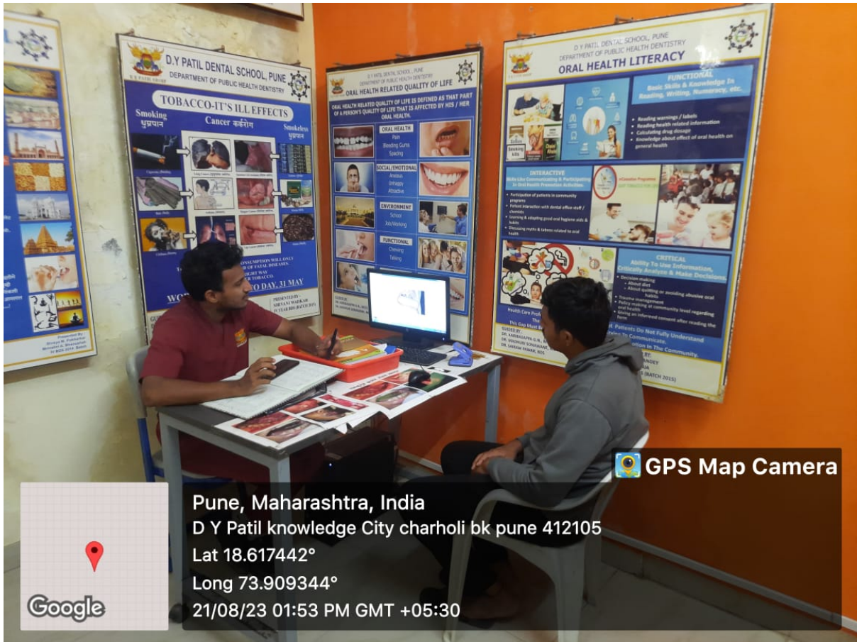
Patient education on Tobacco Cessation at department of Oral Medicine and Radiology