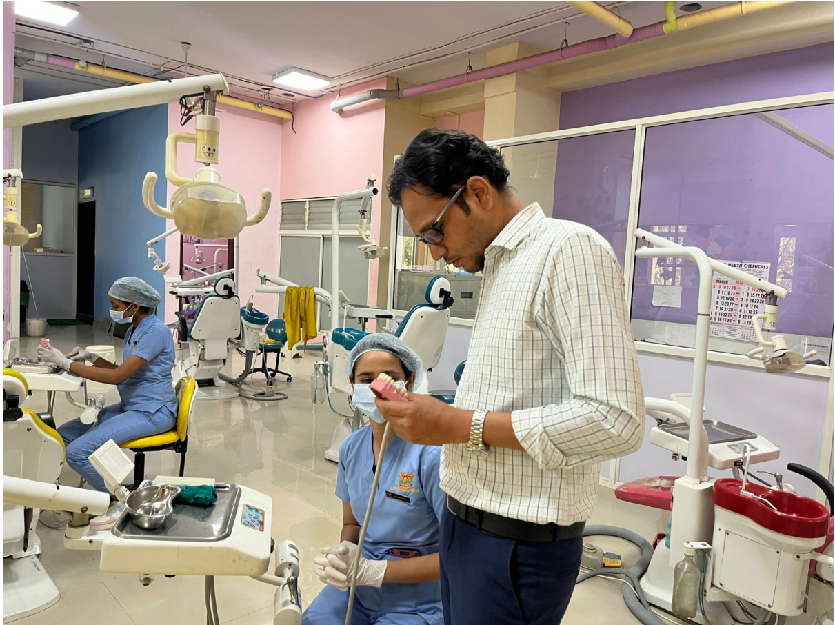
Demonstration by faculty on typhodont in Department of Pedodontics