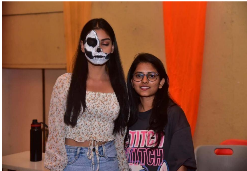
Face Painting Competition