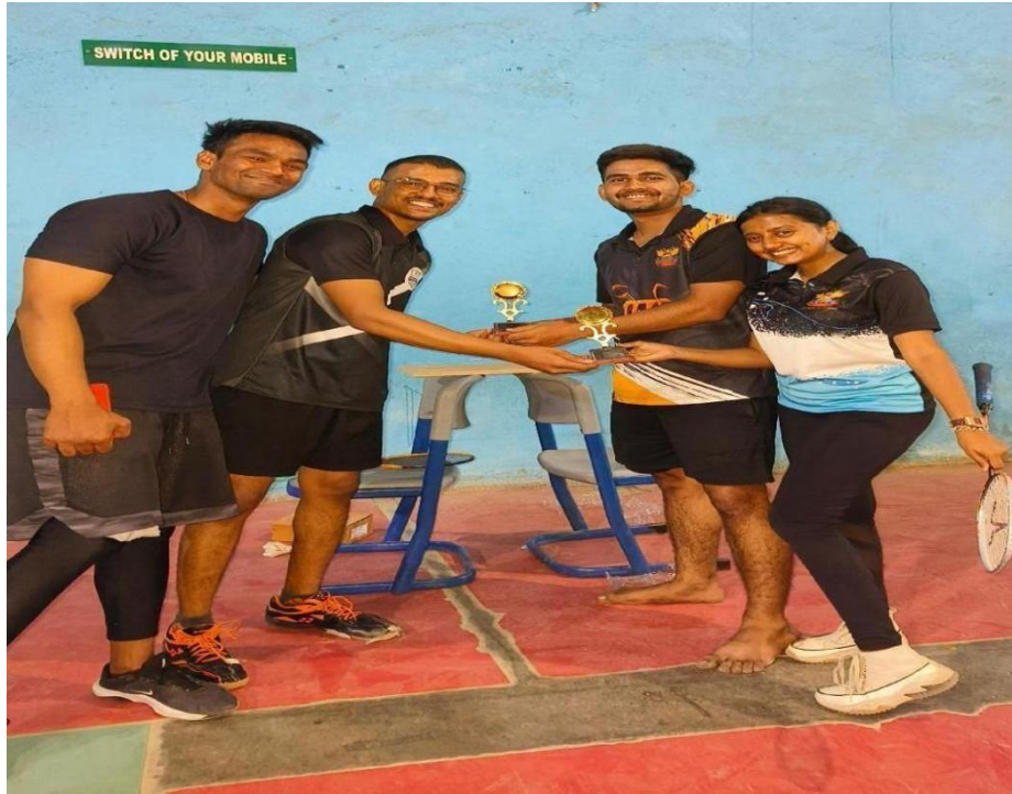
Badminton Prize Distribution